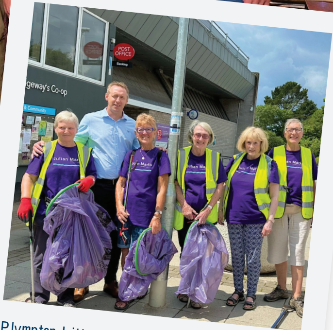
Plympton Litter Pickers